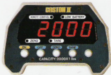
▲ Display & Keyboard