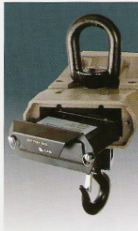
► Battery Pack Installation