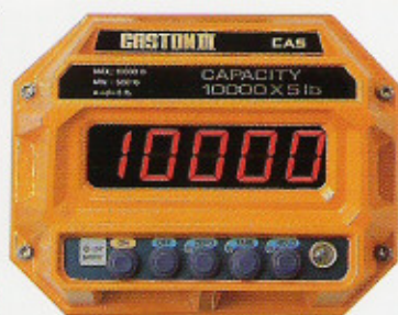
▲ Display & Keyboard