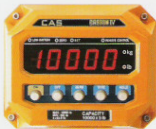
▲ Display & Key board