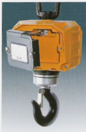
▶ Battery Pack Installation