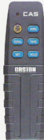
← Remote Control