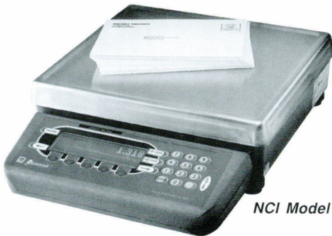
NCI Model 7050

The Model 7050 with Quartzell® digital transducer technology, produces the highest speed and resolution in the industry for USPS bulk mail users. Combining dot matrix alphanumeric display and a tactile keyboard, accurate and easy-to-read information is immediately available. The ability to sample and count from bulk lots increases productivity through piece counting of filled mail trays.