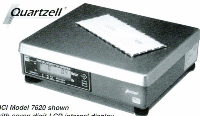
NCI Model 7620 shown with seven-digit LCD internal display.

The NCI Model 7620 is a high resolution postal weight classifier. Featuring a multi-weight range capability this bench scale is designed to weigh letter, flats, parcel and larger packages up to 150 lbs on a single scale.