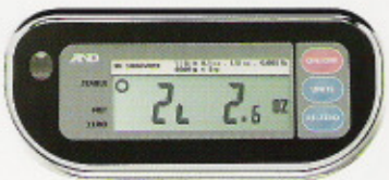
Lb/decimal oz mode, SK-WPZ models