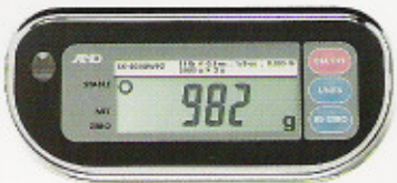
Metric mode, SK-WP models