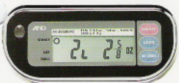
Lb/fractional oz mode, SK-WPZ models