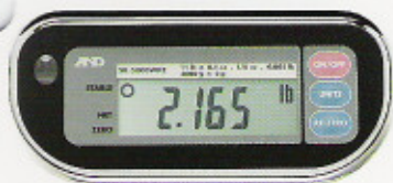
Lb mode, SK-WP models